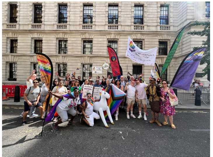
AFTER THE PARADE 2024