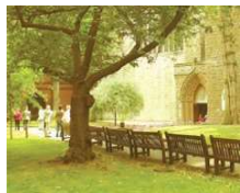
Mount Street Gardens Entrance