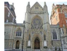
Farm Street Church Entrance