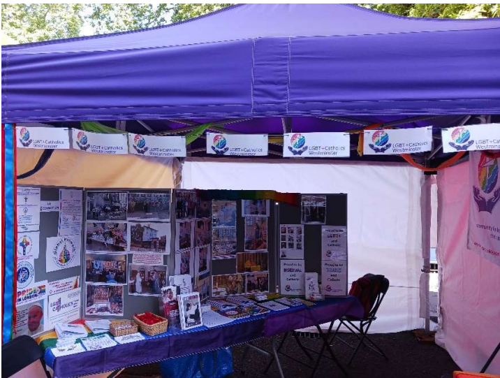
SOHO SQUARE STALL 2024