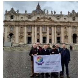
Pope Francis' Ash Wednesday Mass, Santa Sabina - St. Peter's Square, 2023

Please contact secretary@lgbtcatholicswestminster.org if you would like to join us. Limited to 20 places, we already have 15 names confirmed. £150 Deposits to secure accommodation are required NOW. 2025 will also be a Holy Year - Jubilee 2025 - with special events in Rome.