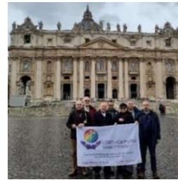
Pope Francis' Ash Wednesday Mass, Santa Sabina - St. Peter's Square, 2023

Please contact secretary@lgbtcatholicswestminster.org if you would like to join us. Limited to 20 places, we already have 15 names confirmed. £150 Deposits to secure accommodation are required NOW. 2025 will also be a Holy Year - Jubilee 2025 - with special events in Rome.