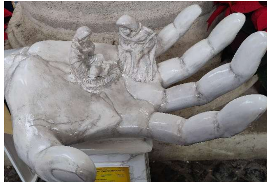
A nativity scene, St. Peter's Square, Rome, December 2024